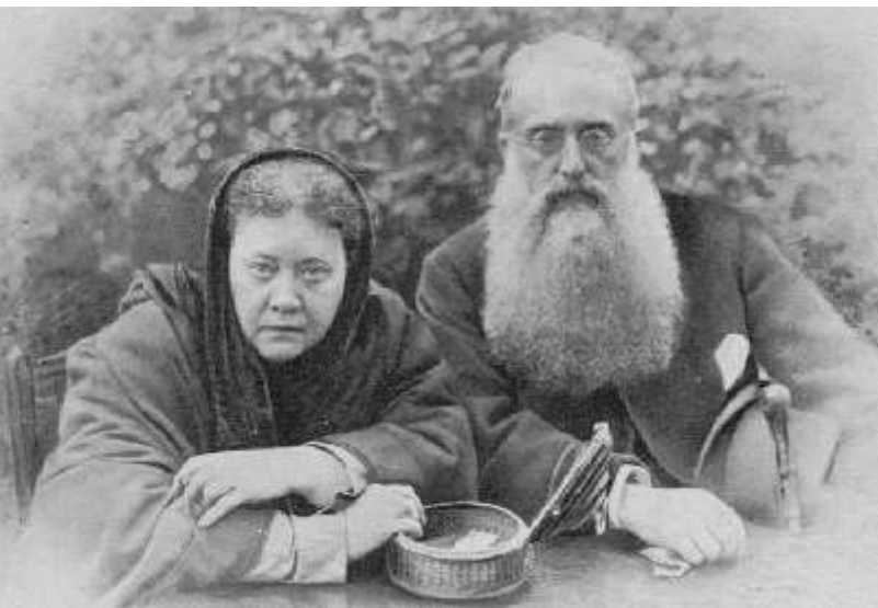
Helena P. Blavatsky and Henry Steel Olcott, co-founders of the Theosophical Society

Theosophy respects the Divine Wisdom basic to the inner side of all religious teachings. It does not seek to convert any person from the religion they hold, but rather to explain and interpret on a rational basis the inner meanings of various creeds and ceremonies. Annie Besant, the second international President of the Society, has stated the Theosophical attitude succinctly: “Theosophy asks you to live your religion, not to leave it.”