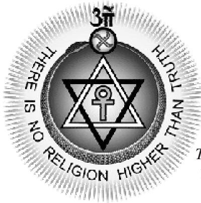
The Seal of the Theosophical Society

A contemporary effort to express the basis of such fundamental concepts is the Theosophical World View: