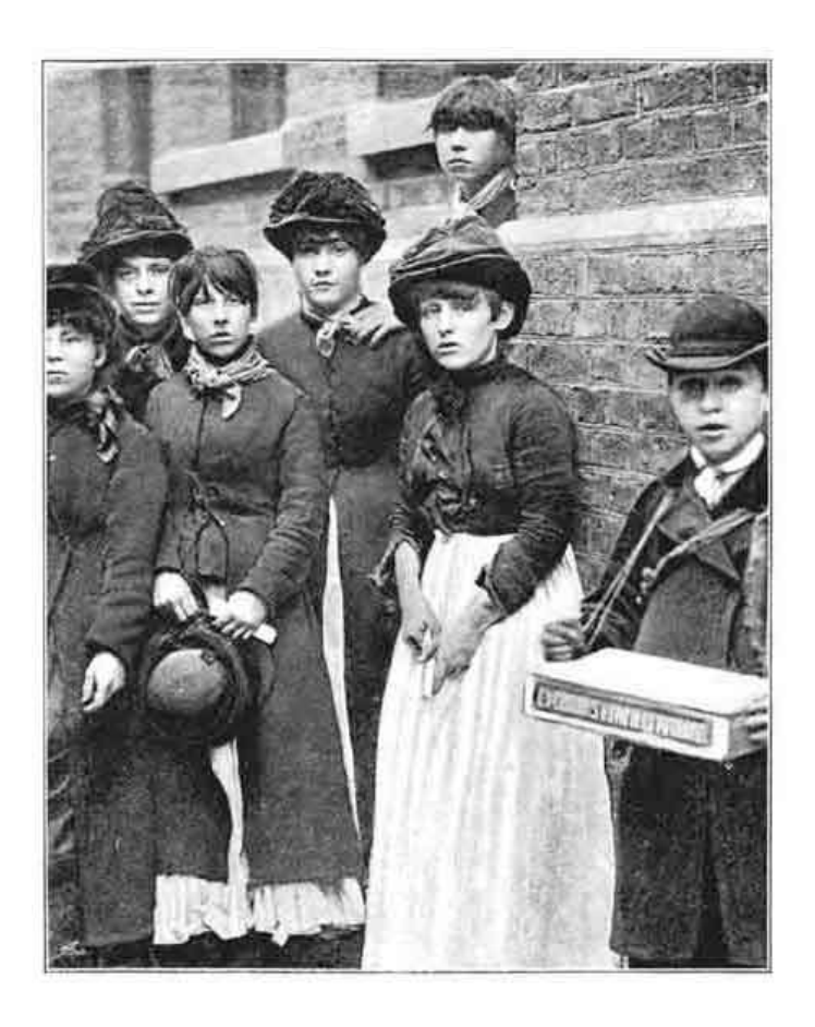
MEMBERS OF THE MATCHMAKERS' UNION.

of, H.P. Blavatsky. Ever more and more had been growing on me the feeling that something more than I had was needed for the cure of social ills. The Socialist position sufficed on the economic side, but where to gain the inspiration, the motive, which should lead to the realisation of the Brotherhood of Man? Our efforts to really organise bands of unselfish workers had failed. Much indeed had been done, but there was not a real movement of self-sacrificing devotion, in which men worked for Love's sake only, and asked but to give, not to take. Where was the material for the nobler Social Order, where the hewn stones for the building of the Temple of Man? A great despair would oppress me as I sought for such a movement and found it not.