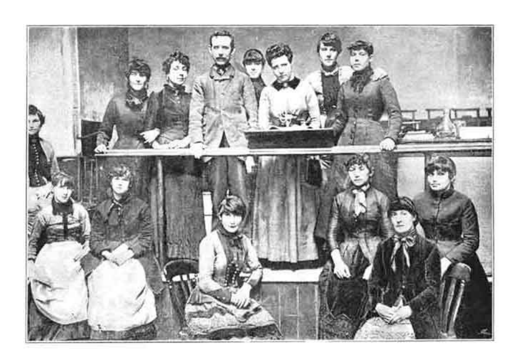
STRIKE COMMITTEE OF THE MATCHMAKERS' UNION.

In August I asked for a "match-girls' drawing-room." "It will want a piano, tables for papers, for games, for light literature; so that it may offer a bright, homelike refuge to these girls, who now have no real homes, no playground save the streets. It is not proposed to build an 'institution' with stern and rigid discipline and enforcement of prim behaviour, but to open a home, filled with the genial atmosphere of cordial comradeship, and self-respecting freedom—the atmosphere so familiar to all who have grown up in the blessed shelter of a happy home, so strange, alas! to too many of our East London girls." In the same month of August, two years later, H.P. Blavatsky opened such a home.