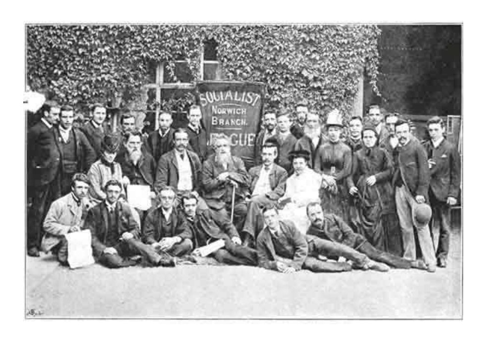
NORWICH BRANCH OF THE SOCIALIST LEAGUE

victor well-nigh bankrupt in health and in purse, and sent him to a comparatively early grave. He lived long enough to justify his election, to prove his value to the House and to his country, but he did not live long enough to render to England all the services which his long training, his wide knowledge, his courage, and his honesty so eminently fitted him to yield.